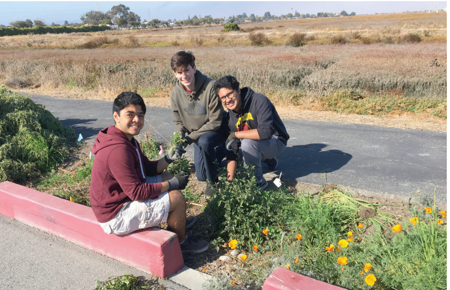
Stewards help beneficial plants flourish within a roadside bioswale at Cooley Landing in East Palo Alto.