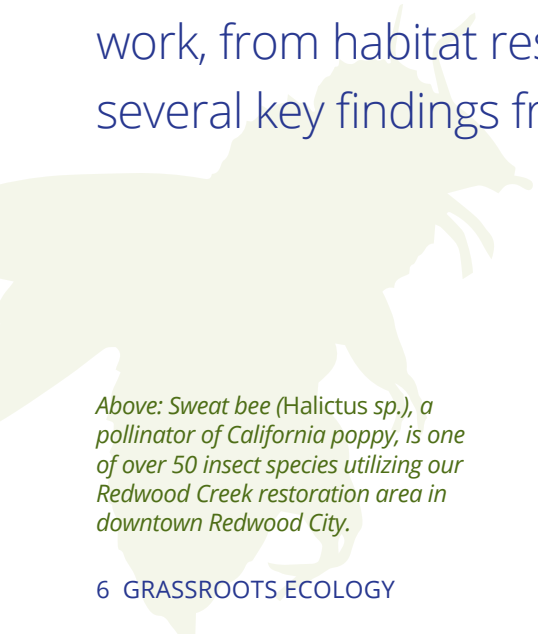
Above: Sweat bee (Halictus sp.), a pollinator of California poppy, is one of over 50 insect species utilizing our Redwood Creek restoration area in downtown Redwood City.

The data we collect is bearing out the importance of our stewardship work, from habitat restoration to creek monitoring. Following are several key findings from different sites.